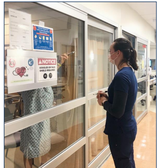
A nurse plays a game of tic-tac-toe with a patient in isolation

To support this fund, visit www.inova.gives/EPF , or email inovadonations@inova.org .